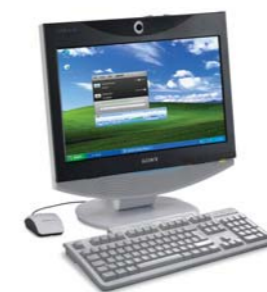
Videoconferencing monitor and PC display in one