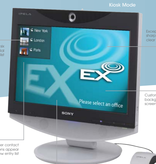
Display up to six one-touch dial buttons in entry list