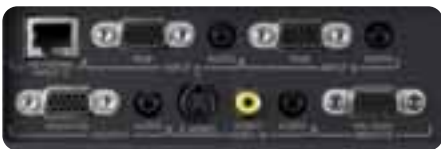
The VPL-CX125, VPL-CX155 and VPL-CW125 all feature RJ45 network connectivity.

You can save energy by turning projectors on and off as required, monitor them and plan preventative maintenance such as lamp replacement and even remotely diagnose problems. It even provides extra security, warning you if a projector is taken off the network. Ziris Manage Lite™ will also work with all Sony network projectors and LCD displays.