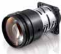
The new, large diameter lens