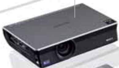
VPL - CX100