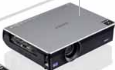
VPL - CX120