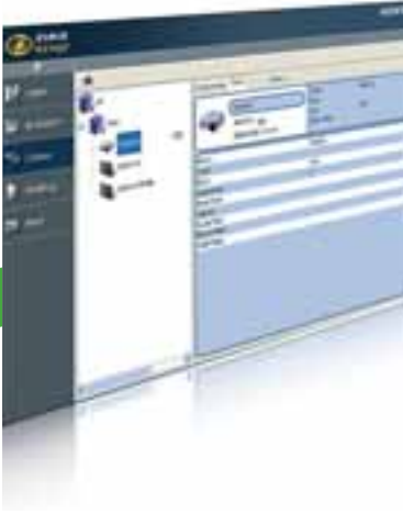
Ziris Manage Lite™