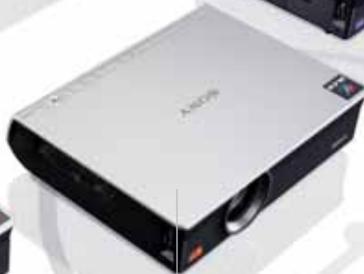
VPL - CW125