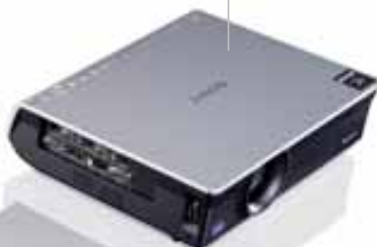
VPL - CX150